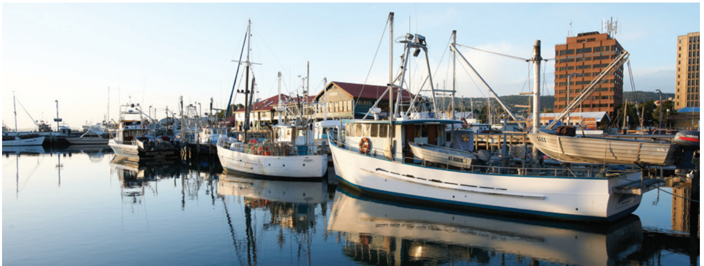
Hobart Waterfront Tourism Tasmania. © Stuart Crosssett