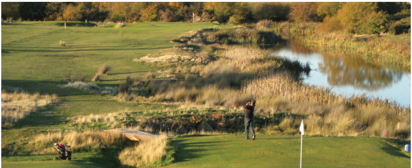
Ratho Farm Golf Links

Minimum numbers: all tours require minimum numbers to proceed. You will be advised by 30 September if a particular tour is not going ahead.