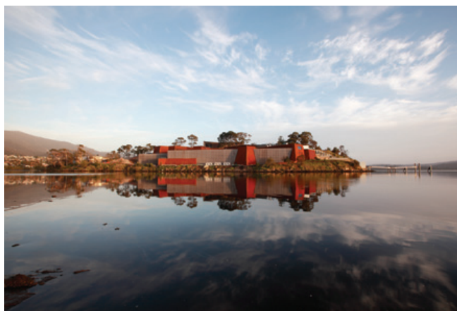
MONA Museum of Old and New Art, Hobart, Tasmania, Australia