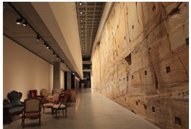
The Void, MONA Museum of Old and New Art, Hobart, Tasmania, Australia

Participant’s work sheets will be assessed and as this is an Olympic year there will be an Award Ceremony with Gold Silver and Bronze prizes awarded.