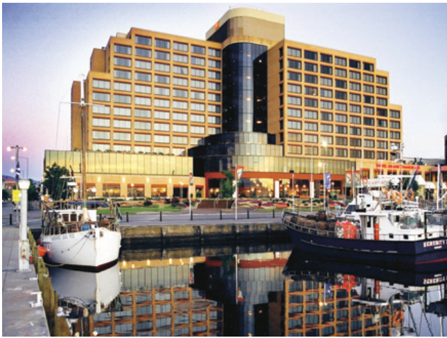
Conference Venue, Hotel Grand Chancellor Hobart

The Hotel Grand Chancellor overlooks Hobart's picturesque and historic harbour, capturing unspoiled panoramic views of the Derwent River or Mount Wellington and the city. The hotel provides a restaurant and bar, gym, indoor pool and sauna, masseuse plus hair salon, art gallery and parking. All rooms have internet access. The hotel is the home of the Tasmania Symphony Orchestra which regularly perform in the Federation Concert Hall adjacent to the hotel.