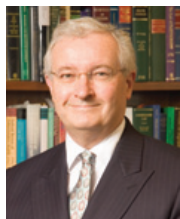
The Hon. Justice James Allsop New South Wales

The central role of insurance in modern society and in the development of the law