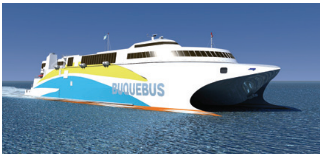
Hull 069 99m wave piercing catamaran under construction Incat Tasmania Pty Ltd

Dress: Long sleeved shirt or jumper and enclosed flat shoes. Hard hats and hi-viz vests will be supplied.