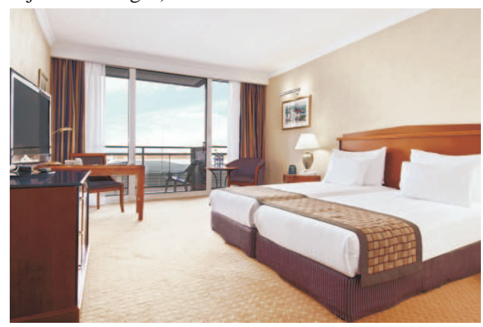
Regular Guest Room

Double occupancy: US$280 per night including full Israeli breakfast