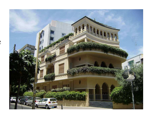
13:30 – 14:30 Lunch in old Jaffa.